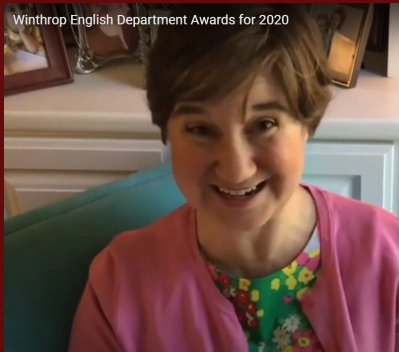
Winthrop English Department Awards for 2020