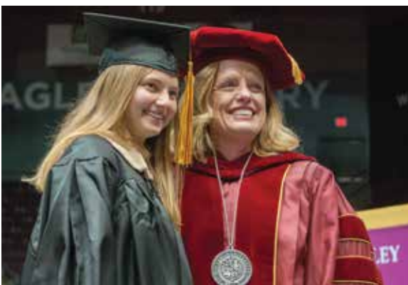
Comstock posed for a photo with a graduate during the December 2013 graduate Commencement ceremony, the first Commencement ceremony that Comstock presided over since becoming president.