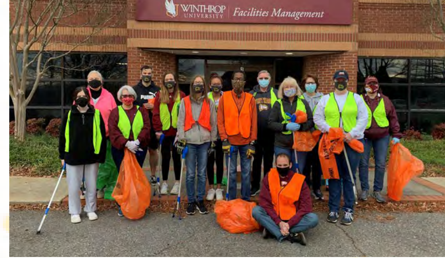
Campus & Community Involvement organized a group of staff members who spent a Saturday picking up litter on campus.