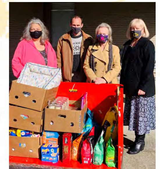
Members of the Campus & Community Involvement Committee delivered pet food collected for Meals on Wheels. Our 2020 food drives collected 255 lbs. of food for the Human Nutrition food pantry and 175 lbs. of pet food (along with blankets and toys)!

Story or content ideas? Contact a member of the Media & Communications Committee: