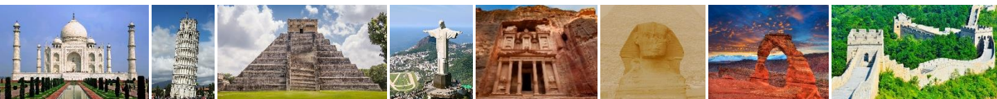
Left to Right: Taj Mahal in India; Leaning Tower of Pisa in Italy; Chichén Itzá in Mexico; Christ the Redeemer in Brazil; Petra in Jordan; Great Sphinx of Giza in Egypt; Utah's Arches National Park in America; Great Wall of China Winthrop University | Division of Student Affairs | Office of New Student & Family Programs

If you've already ordered your textbooks for the fall, they are ready for pick-up in the Winthrop Bookstore.