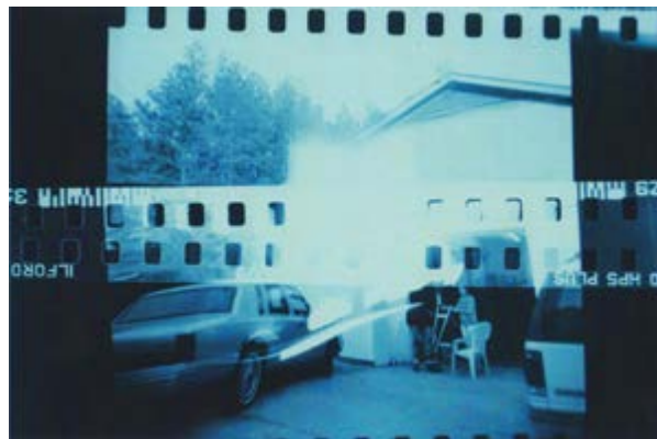
Sommer Moya-Mendez, Photography 2

MFA Thesis Closing Reception 5:30 – 7:00 pm Elizabeth Dunlap Patrick Gallery