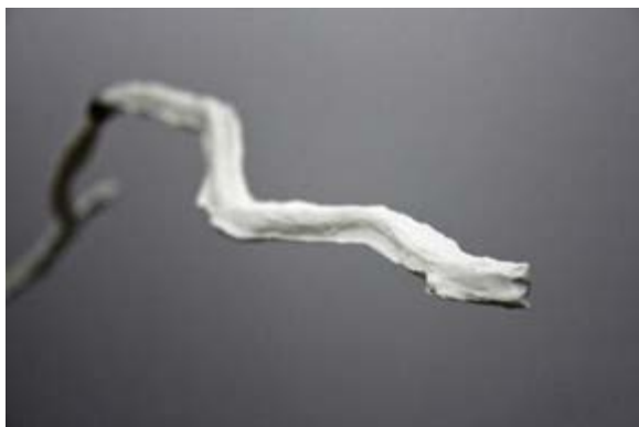
"Untitled" (detail) by Sandy Singletary

RubberMADE is a collection of objects, both interactive and wearable, inspired by the exploration of the mid-20 th century American culture of consumerism and processed goods. The catalyst for this body of work was Starrett's curiosity about the history and industrial uses of silicone rubber and the relationship this synthetic material has with a 1950's style post-war "suburban" ranch house. It is this relationship that has fueled the forms, colors, and titles of the works in the RubberMADE collection.