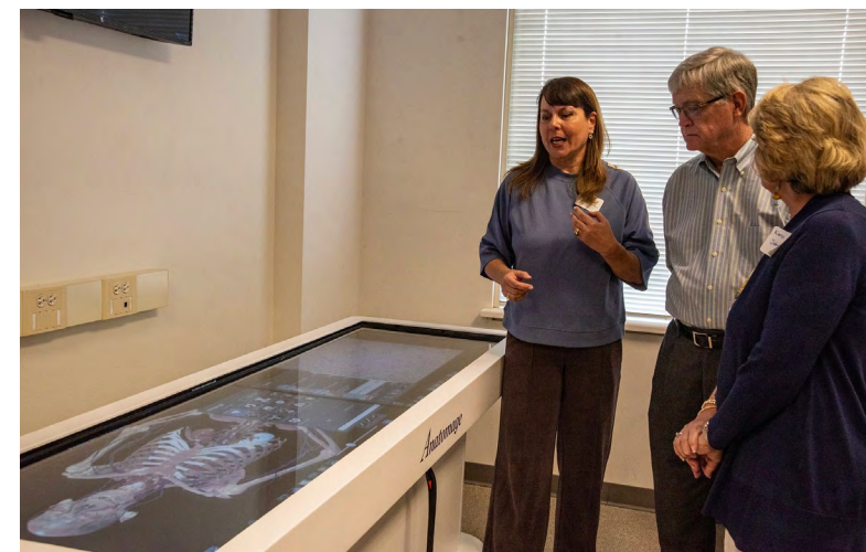
Clockwise from top: With $9M in state funding, Winthrop renovated its science facilities and celebrated with a ribbon cutting on April 21. Dalton Hall (lab pictured above) and Sims Science Building (chemistry lab on left) will serve Winthrop science majors well into the future.