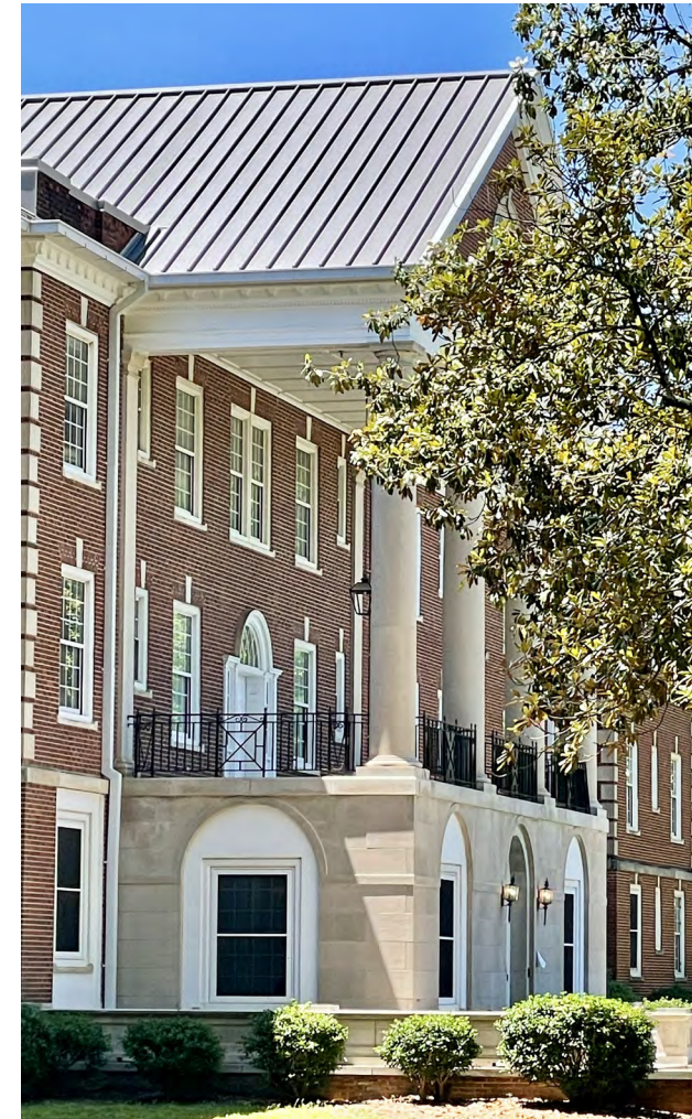
Clockwise from top: Institutionally funded, the new Phelps roof will protect the historic residence hall for years to come. New branding takes flight at the West Center. Funded by the state, the $1.6M Joynes Hall project will significantly impact the student experience. State and donor funds created a new gateway into campus, connecting the campus sidewalk network to Stewart Avenue and ensuring a safe pedestrian thoroughfare.