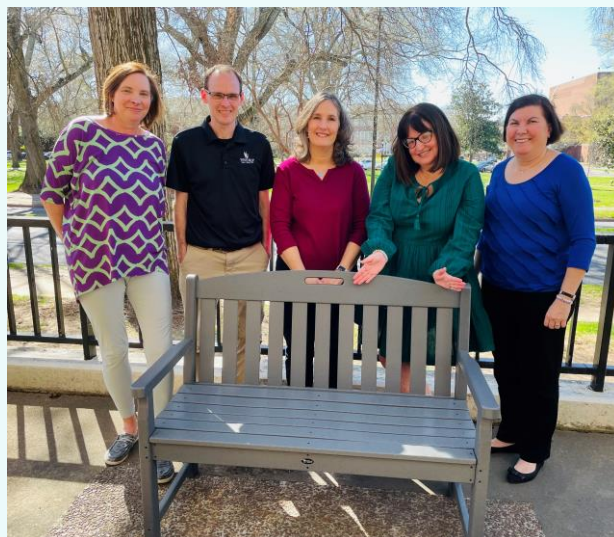
Image shows second bench located at the Dacus Library for an example of what these recycled items can become!

In addition, we could really use some volunteers to help deliver collected bags to locations that accept plastic recyclable bags such as Publix and Harris Teeter. Please reach out to Melanie Sanders if you are interested in helping with this initiative. Thanks!