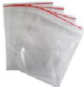
RESEALABLE FOOD STORAGE BAGS