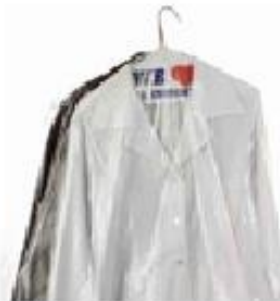
DRY CLEANING BAGS